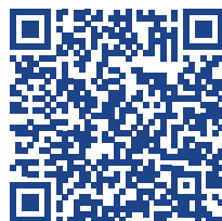
Scan this QR Code to see our full donor list!